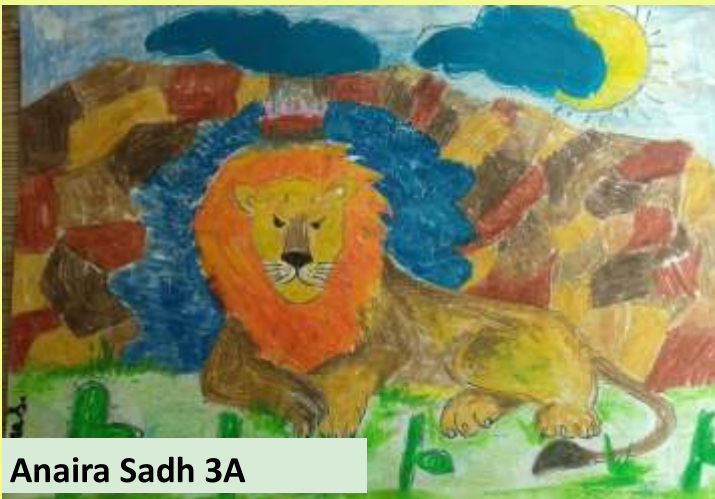
Anaira Sadh 3A