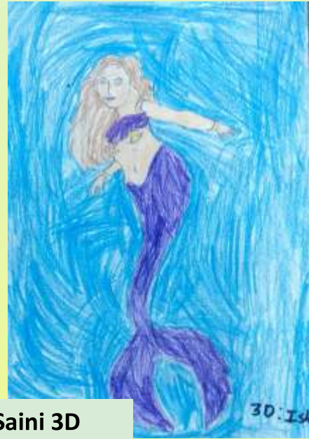
Isha Saini 3D