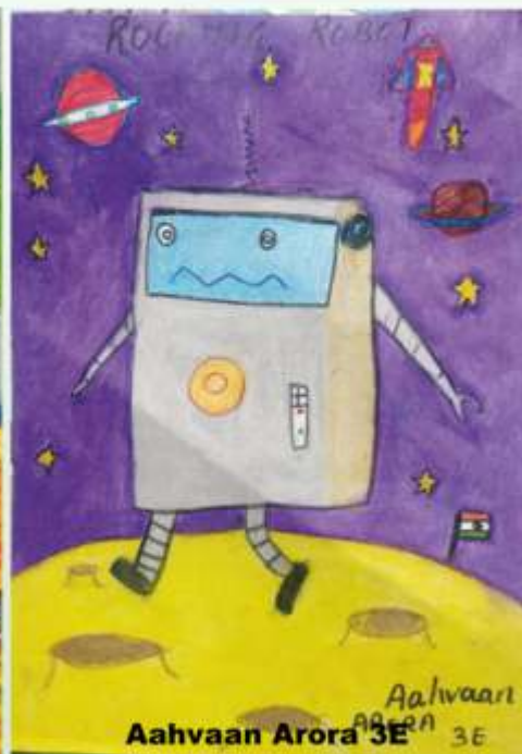
Aahvaan Arora 3E